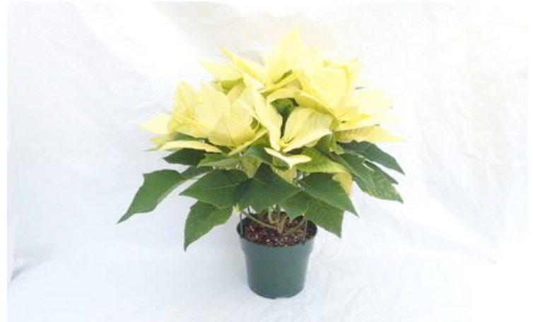
Green Envy 2019

Eight specialty entrees were submitted by Dümmen Orange. RF535 JIN Experimental, a new jingle selection, and Ice Punch both were highlighted by growers.