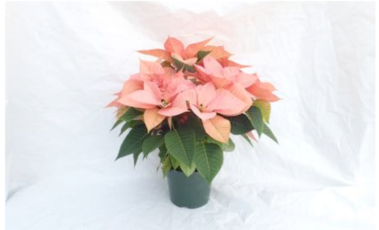
Christmas Beauty Cinnamon

Selecta/Ball Horticulture had five specialty cultivars in the trials. Christmas Beauty Princess and Christmas Feelings Red Cinnamon were highlighted by growers as cultivars of interest.