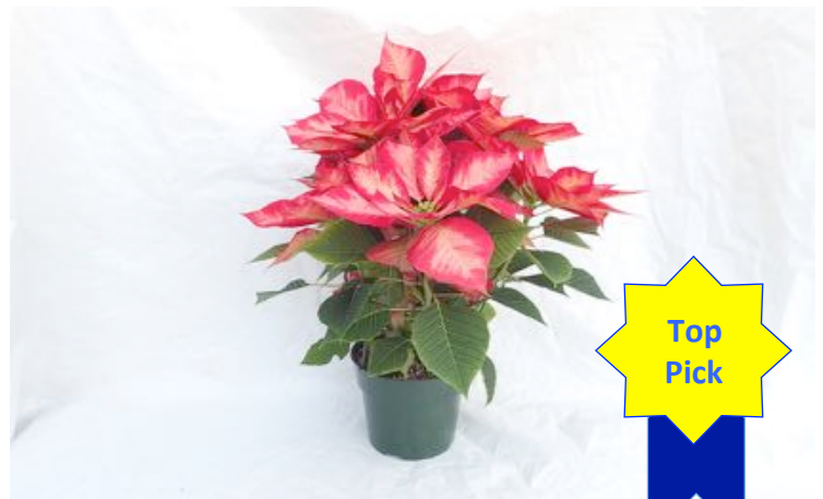
Christmas Beauty Princess