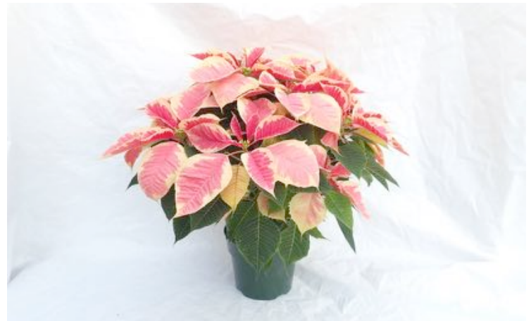
Christmas Beauty Marble

Selecta/Ball Horticulture had five specialty cultivars in the trials. Christmas Beauty Princess and Christmas Feelings Red Cinnamon were highlighted by growers as cultivars of interest.