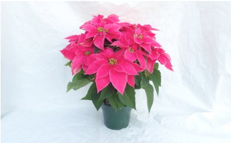
Princettia Pink Queen