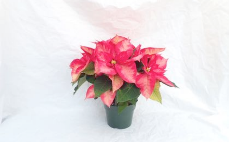
Premium Ice Crystals