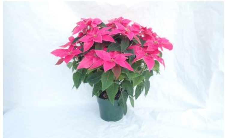
Princettia Dark Pink

Suntory submitted their Princettia line of poinsettias to the trial. Princettia Pure White and Princettia Red made an excellent combination for the NC State University graduation. The compact growth of the Princettia line makes them well suited for smaller sized pots.