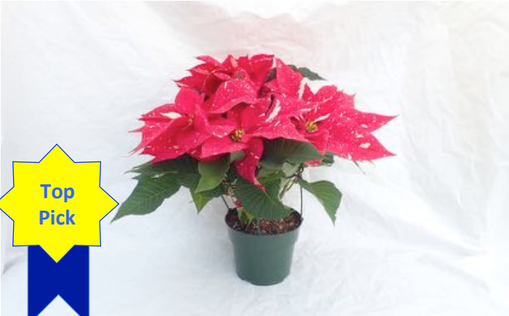
RF535 JIN Experimental