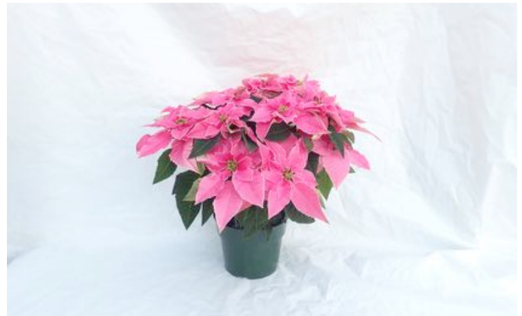
Princettia Hot Pink