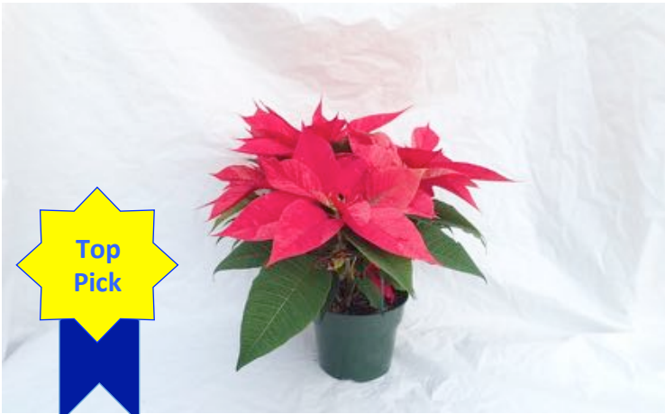
Christmas Feelings Red Cinnamon