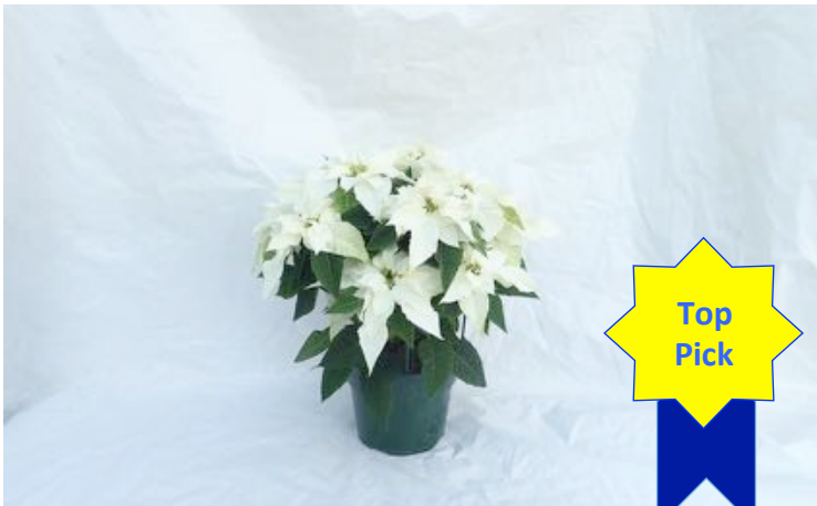
Princettia Pure White