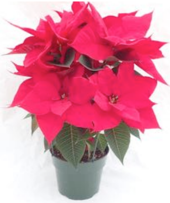
Christmas Bells SK 159 (early planting)