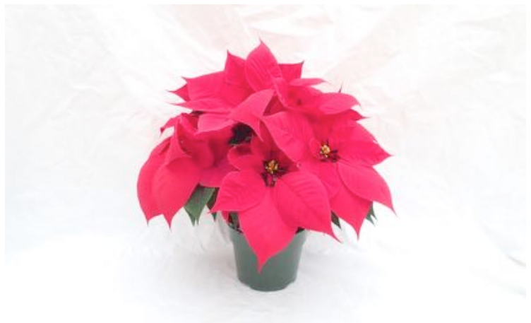
Christmas Glory Red