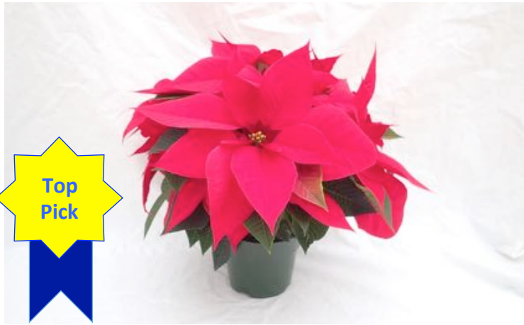
Futura Brilliant Red