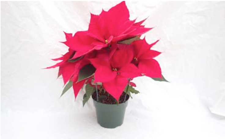
SK 168 Experimental