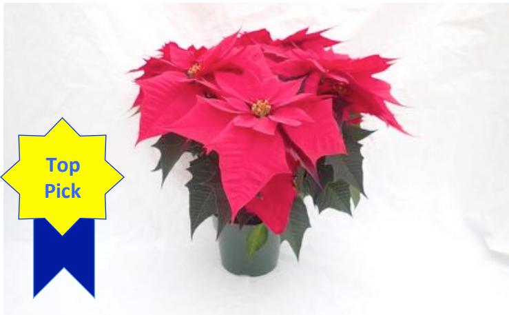
PON 127 Red Experimental