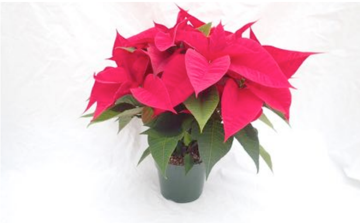
SK 176 Experimental