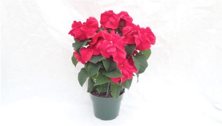
Winter Rose Early Red