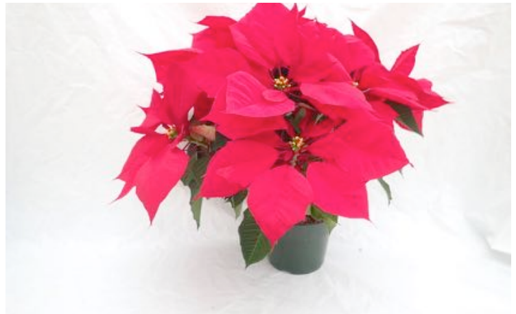
PON 100 Red Experimental