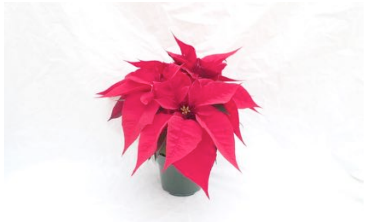
Christmas Feelings Merlot