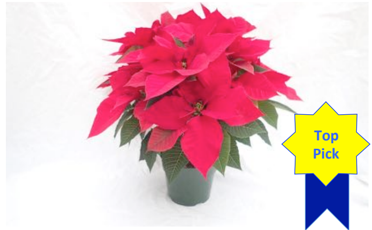
Red Experimental 16-678

Rinehart Poinsettias included three cultivars in the trials. Two were white and one was red. The Red Experimental 16-678 had exceptionally strong stems and would be ideal for a retail grower.