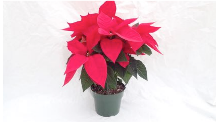
Prima Red 2.0