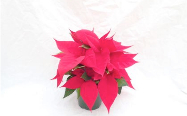
Christmas Joy Red