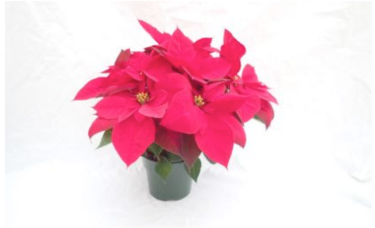
Allegra Early Red

Lazzeri is an Italian plant breeder. Lazzeri partnered with both Ball Horticulture/Selecta and Syngenta to submit cultivars. Futura Brilliant Red, Opera and Superba Red were highlighted as top picks by growers.