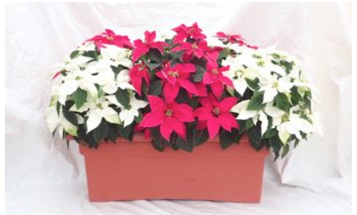
Planter containing Princettia Red and Princettia Pure White.

Suntory submitted their Princettia line of poinsettias to the trial. The compact growth of Princettia Red makes it well suited for smaller sized pots.