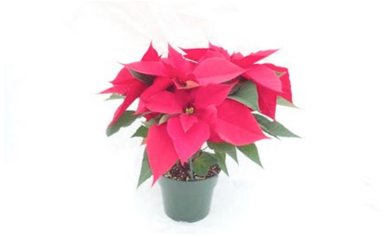
Bravo Bright Red