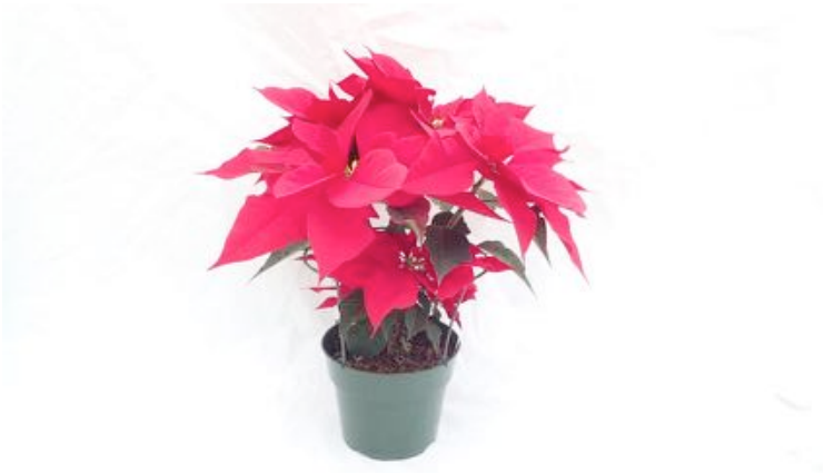
Prestige Early Red