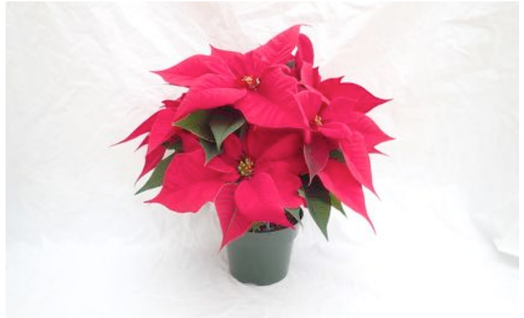
SK 167 Experimental