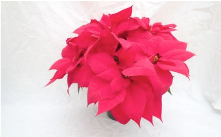
PON 122 Red Experimental