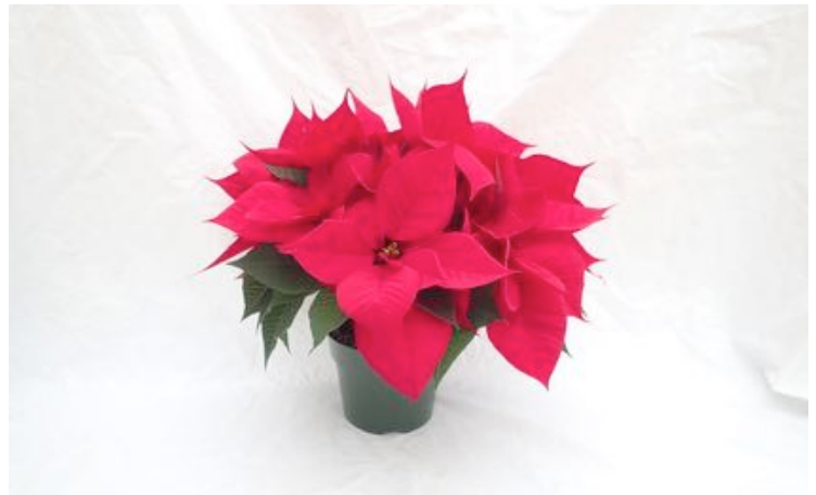
PON 126 Red Experimental