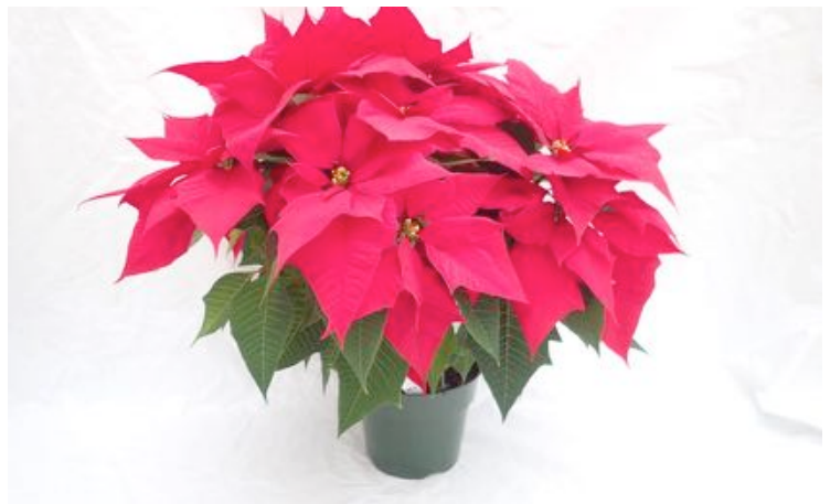
PON 131 Red Experimental