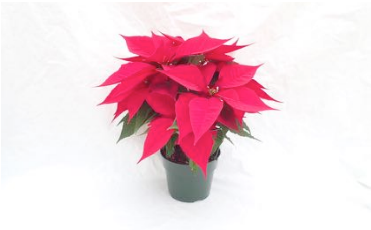
Christmas Feelings Red