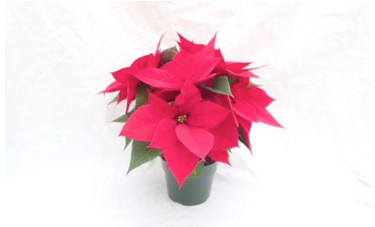
Christmas Beauty Red

Selecta/Ball Horticulture had 21 red cultivars in the trials. Two new unique types were introduced. Sky Star had red bracts with a scattering of white. Christmas Mouse had round bracts that was unique and made it stand out. Christmas Bells (SK 159 Experimental) was also one highlighted by growers as one new cultivar of interest.