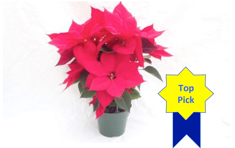
Christmas Bells SK 159 (late planting)