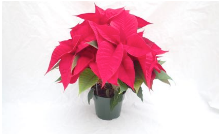
SK 175 Experimental