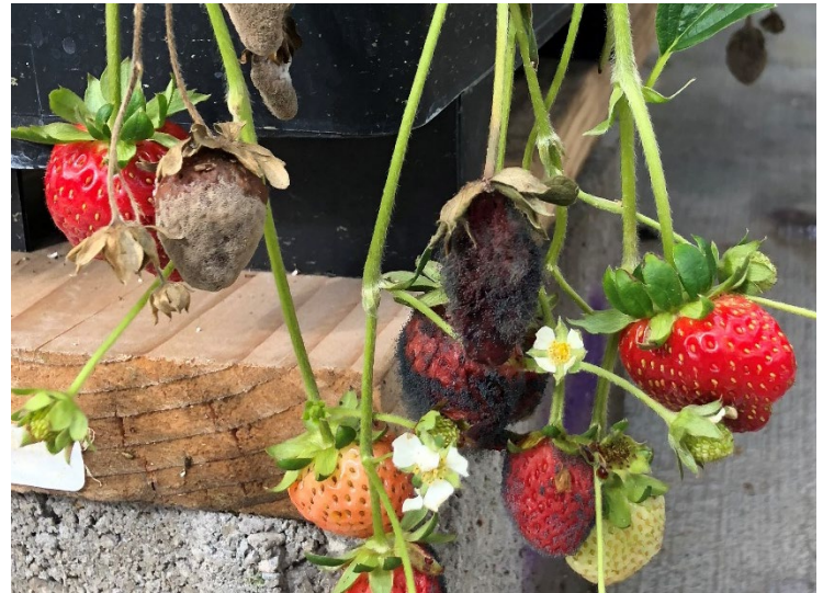
Fig. 3. Gray mold is evident on the strawberry on the upper left whereas a different pathogen Rhizopus is responsible for the black growth on the strawberry cluster on the right.