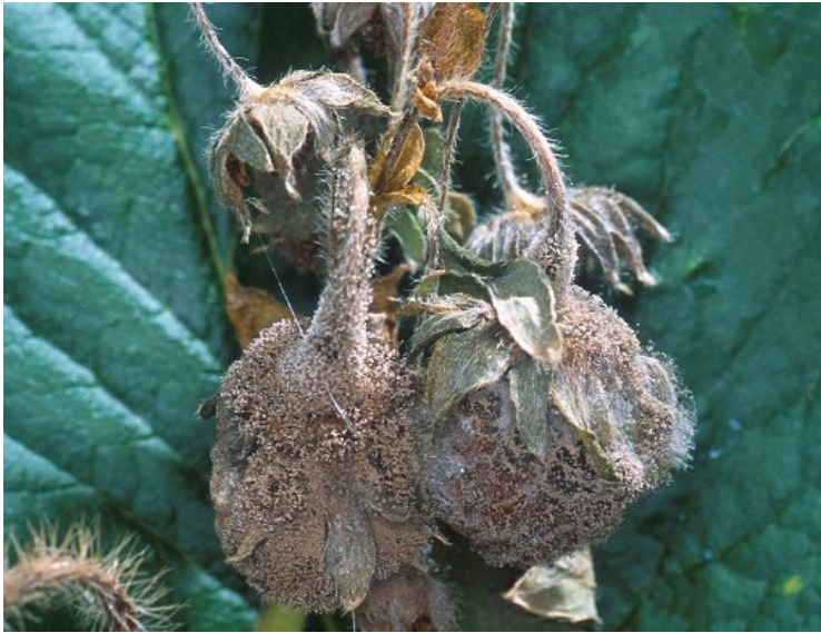
Fig. 2. Gray mold on fruit cluster, calyx, and peduncle of strawberry.