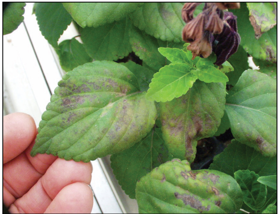
Dead spots or blotches and yellowing are some signs of chemical injury, here on salvia.

Hachi-Hachi: Do not apply to Salvia spp., Impatiens spp., Gypsophila spp, or poinsettias with bracts in color. Temporary