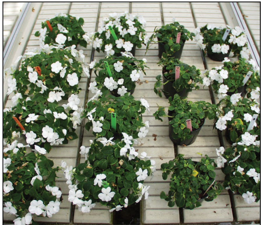
Flowers and foliage on one set of impatiens were damaged following spray with an experimental insecticide.

(evenly distributed in the crop or across cultivars? Localized to one or a few plants? Only recently expanded leaves affected?), and of course what applications (products, rates,