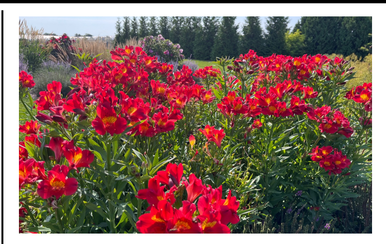
Photo 6. Alstroemeria 'Summer Heat' would be great as a back of the border plant or a central focal point.