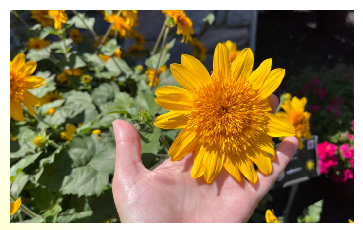
Photo 19. Large double, yellow flowers of Sunfinity® 'Double Yellow'.