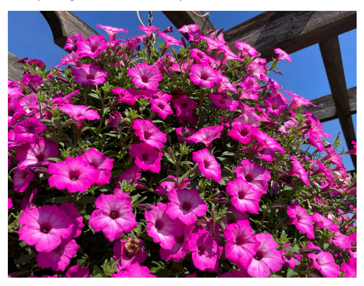
Photo 13. Supertunia 'Tiara Pink' is a vigorous princess pink petunia with a luminescent glow emanating from the center.