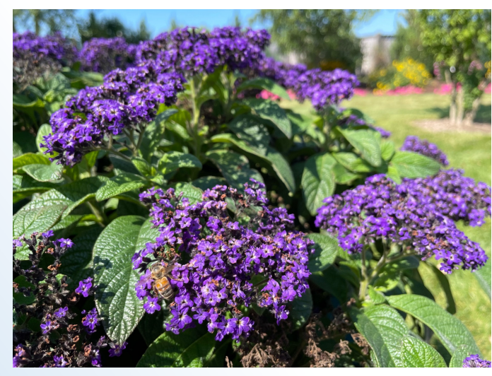
Photo 25. Aromagica<sup>™</sup> Purple Heliotropium featured a wellbranched habit and tidy appearance.