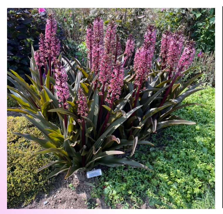
Photo 8. Eucomis 'Purple Reign' has purple spikes of flowers on bronze strappy foliage.