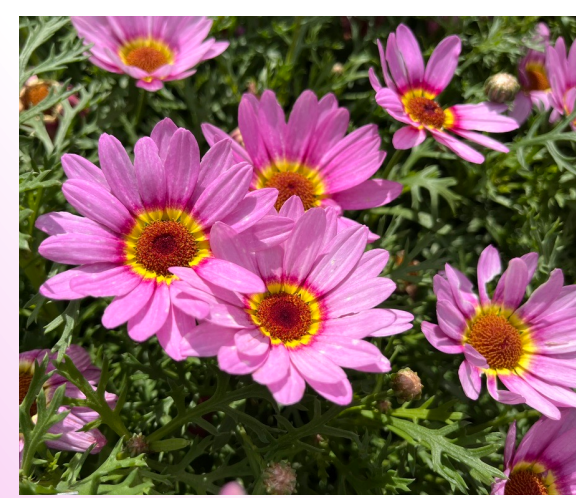
Photo 10. Delicate pink and yellow flowers of Argyranthemum Grandaisy<sup>®</sup> 'Pink Halo Improved.'

I was drawn to this cute pink variety of Argyranthemum, 'Pink Halo Improved' at the MSU trial gardens. The yellow-centered pink flowers were very attractive, and the plant created a nice carpet within the plot. I was surprised at the excellent garden performance of the Grandaisy® series, which was so floriferous and showy, especially during August considering they serve as an early season crop often offered in the spring alongside Osteospermums.