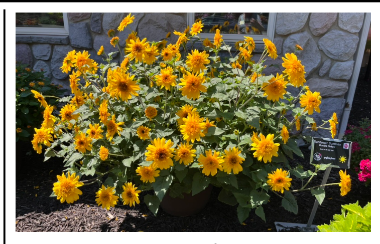
Photo 20. Prolific habit of Sunfinity® 'Double Yellow.'

The bees and I are also fans of single dahlias that retain their pollen-filled centers. Though they often are less showy than their multi-petalled counterparts, Dahlia 'Mystic Spirit' from Kientzler gives them a run for their money. The large flowers displaying an eye-catching hue of peachy goodness with a just a touch of rosiness sit atop robust mahogany to black foliage. The blooms are vivid against the dark backdrop of foliage. This variety is a must have for a middle of the border planting or a fashionable container.