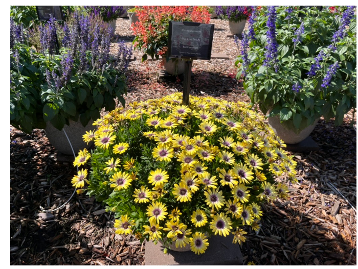
Photo 23. Osteospermum 'Blue Eyed Beauty' has a showy, unusual lavender, white and yellow flower.

Another pollinator favorite at the Four Star display gardens that I also admired for its top performance was Aromagica<sup>TM</sup> Purple Heliotropium arborescens . In addition to being a pollinator magnet, the large, deep purple inflorescences are fragrant and well-branched. Even as some blossoms were passing, new ones were developing right overtop giving the plant a very clean appearance with little to no maintenance.