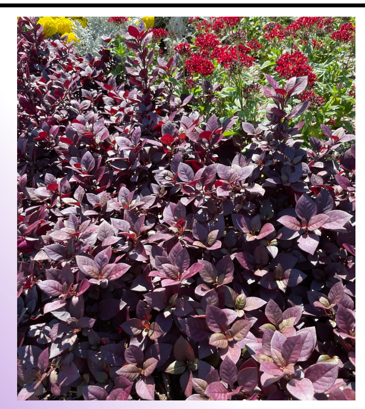
Photo 26. The deep burgundy coloration of Alternanthera 'Purple Prince' creates a tidy border in front of the colorful flowers behind.