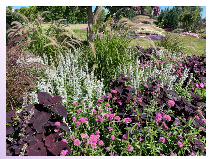
Photo 28. Unplugged® White Salvia alongside best sellers Truffula® Pink Gomphrena, Graceful Grasses® Purple Fountain Grass, and ColorBlaze® Newly Noir<sup>TM</sup> Coleus.

It's not often that white flowers steal the show, but the new Unplugged® White Salvia was a standout, a favorite of mine and the pollinators. In the display beds it was featured with best sellers Truffula® Pink Gomphrena, Graceful Grasses® Purple Fountain Grass, and ColorBlaze® Newly Noir<sup>TM</sup> Coleus.