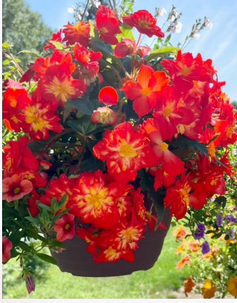
Photos 4 & 5. Begonia Beaugonia 'Poppy Peach' (L) and 'Poppy Orange' (R) had phenomenal color for shade plants.