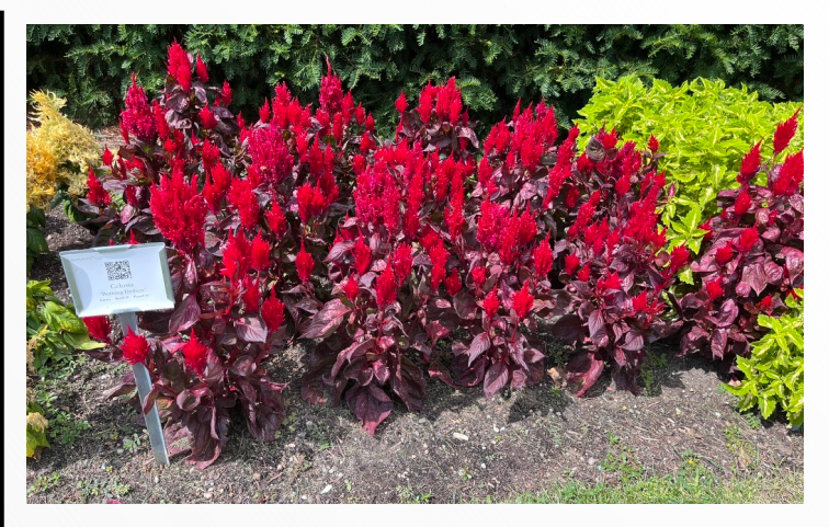
Photo 2. Celosia 'Burning Embers' exhibits fiery red flowers on crimson foliage at MSU trial gardens.

I always love a splash of color for the shade and really love tuberous begonias for their large flowers. Both begonia 'Beaugonia Poppy Peach' and 'Beaugonia Poppy Orange' had showstopping large multi-colored flowers at DGI Propagator's trial gardens. The peach varieties have bright salmon, peach, and yellow flowers that cascaded over the side of the container in the shade garden. The orange variety was in combination with other plants, but stole the show with vibrant yellow, orange, and red flowers.