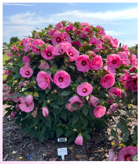
Photo 14. Hibiscus Summerific® 'Candy Crush' features huge 8" flowers on a tidy, but large foliage.