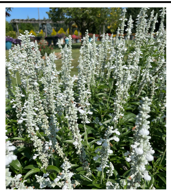
Photo 27. Unplugged® White Salvia covered in bees.