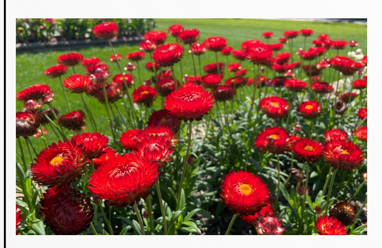
Photo 3. Cheery, red bracts of this supersized strawflower, GRANVIA 'Crimson Sun', welcome the day's bright sunshine.