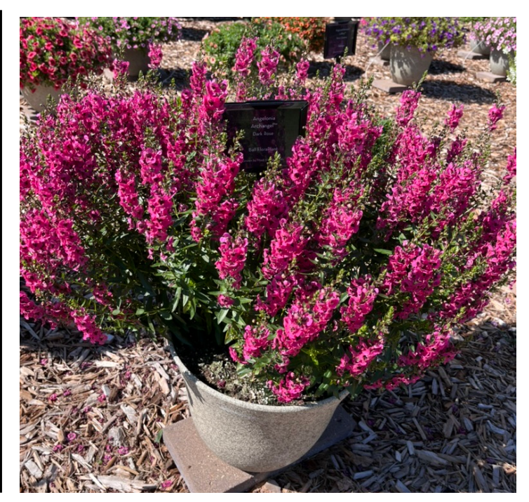
Photo 9. Dozens of flowers on the raspberry Angelonia Archangel 'Dark Rose'.