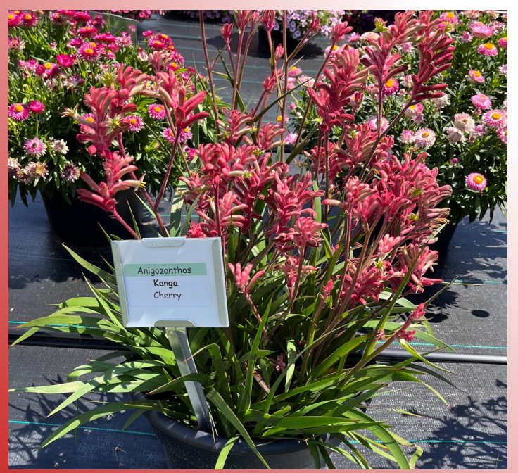
Photo 7. Anigozanthos Kanga 'Cherry' was particularly floriferous.

Those who are familiar with cut flowers in the florist trade will be happy to see that Alstroemeria, or Peruvian lilies, made my list for 2024. Walters Gardens is releasing 3 new varieties in this genus for 2024-2025, all with beautiful flowers. 'Summer Heat' stands 3 to 3.5 feet tall and is a great back of the border variety that attracts pollinators. The flowers are bright red with yellow throats. It added vibrant color to this display bed. It has overwintered multiple seasons in Zone 6 in Zeeland, MI and it blooms midsummer through frost. It is a great addition to the back of a border garden or an addition to a cut flower garden.