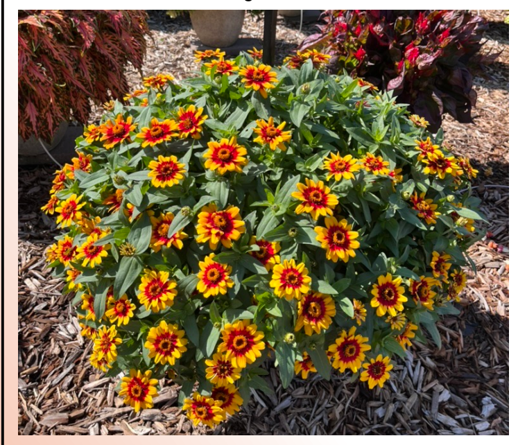
Photo 18. Zinnia Profusion 'Red Yellow Bicolor' atop a healthy mounded habit.