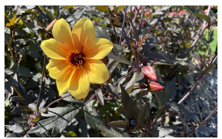
Photo 21. The peach blossoms atop Dahlia Mystic 'Spirit.'