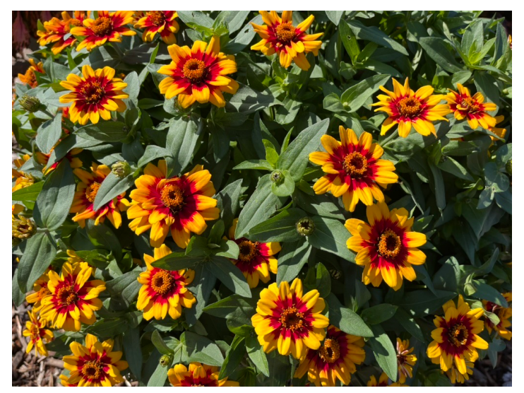
Photo 17. Bright bicolor flowers of zinnia Profusion 'Red Yellow Bicolor.'