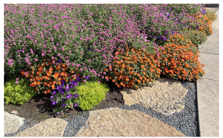
Photo 16. Mojave® Tangerine Portulaca Improved pops amongst the sea of Truffula® Pink Gomphrena behind its flashy border.

Zinnia Profusion 'Red Yellow Bicolor' was the 2021 AAS trial winner and has previously won the Fleuroselect Gold Medal award for performance in European flower trials. While not brand new, 'Red Yellow Bicolor' was a strong contender with its excellent mounding habit and cheery red and yellow flowers at the 2024 trial garden.