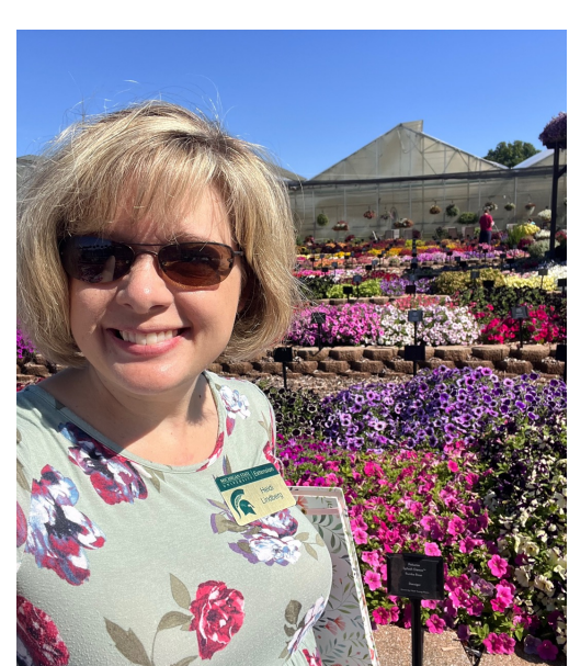
Photo 1. It's always a good day to visit trial gardens!

Every year Michigan State University and Michigan's leading young plant producers host a free open house at their trial sites and display gardens to give growers, landscapers, and retail operators the opportunity to learn about a wide range of ornamental crops. Industry professionals can see for themselves which new varieties perform the best under various conditions, including in the ground and in containers. The tour lasts for two weeks and was held this year from July 29-August 9, 2024.