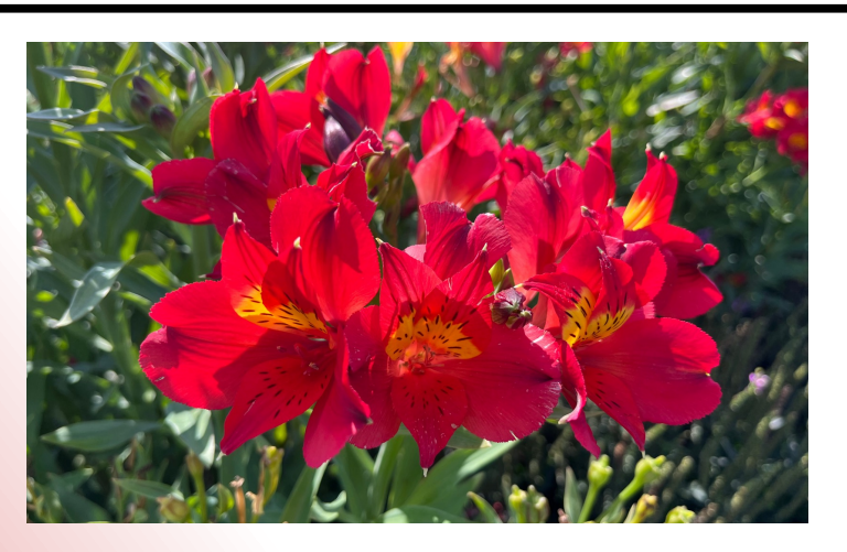
Photo 5. Alstroemeria 'Summer Heat' features fiery red flowers with yellow throats.