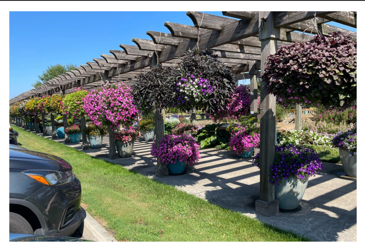
Photo 12. Supertunia 'Tiara Pink' petunia catches my eye from the parking lot.

It wouldn't be a Michigan Garden Plant Tour without choosing a Summerific® hardy hibiscus as a favorite! Walters Gardens has all their varieties of hardy hibiscus planted in a large bed and some in a stunning large border bed across the garden. 'Candy Crush' is not the newest introduction in the series but had showy pink flowers with deep throats in a tidy 5-foot ball-like habit. The sturdy stems held the large flowers upright without flopping over.