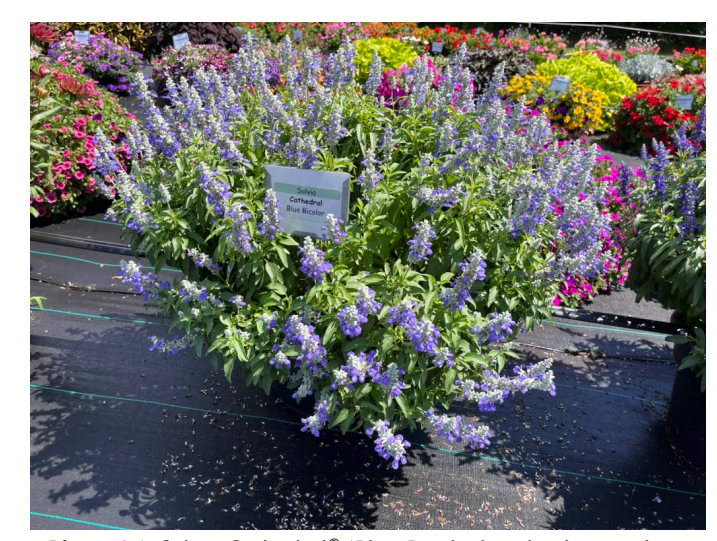
Photo 24. Salvia Cathedral® 'Blue Bicolor' with white and purple flowers was a pollinator magnet.