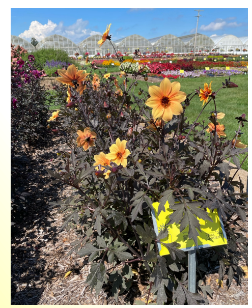
Photo 22. The contrast of the peach blossom of Dahlia Mystic 'Spirit' with the deep mahogany foliage, makes it appear even darker in color.