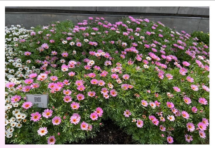
Photo 11. Argyranthemum Grandaisy® 'Pink Halo Improved' created a pink carpet.