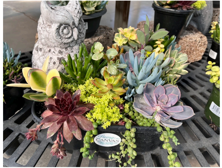
Photo 4 and 5. A 4-inch container (left) and a larger container (right) with a variety of succulents in production containers meaning customers can place them into a fancier container.

Often these containers are displayed with or near pottery and other interesting containers to plant them into. This is an example of cross merchandising where two complementary products are positioned by each other in the retail center to demonstrate use and heighten the probability of customers buying both products together.