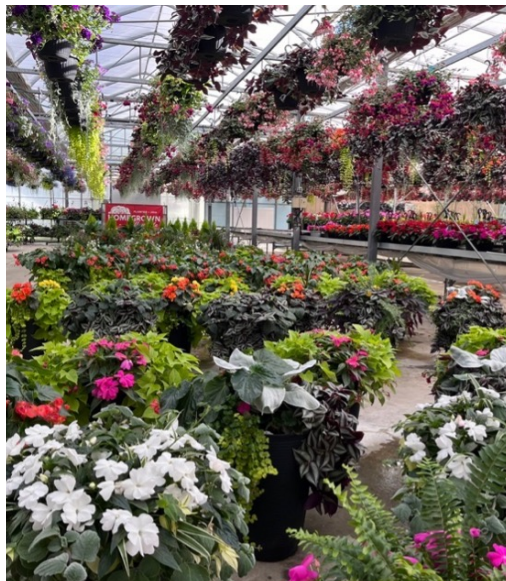
Photo 1. West Michigan garden center full of ready-to-go hanging baskets and container gardens to beautify decks, porches and patios.