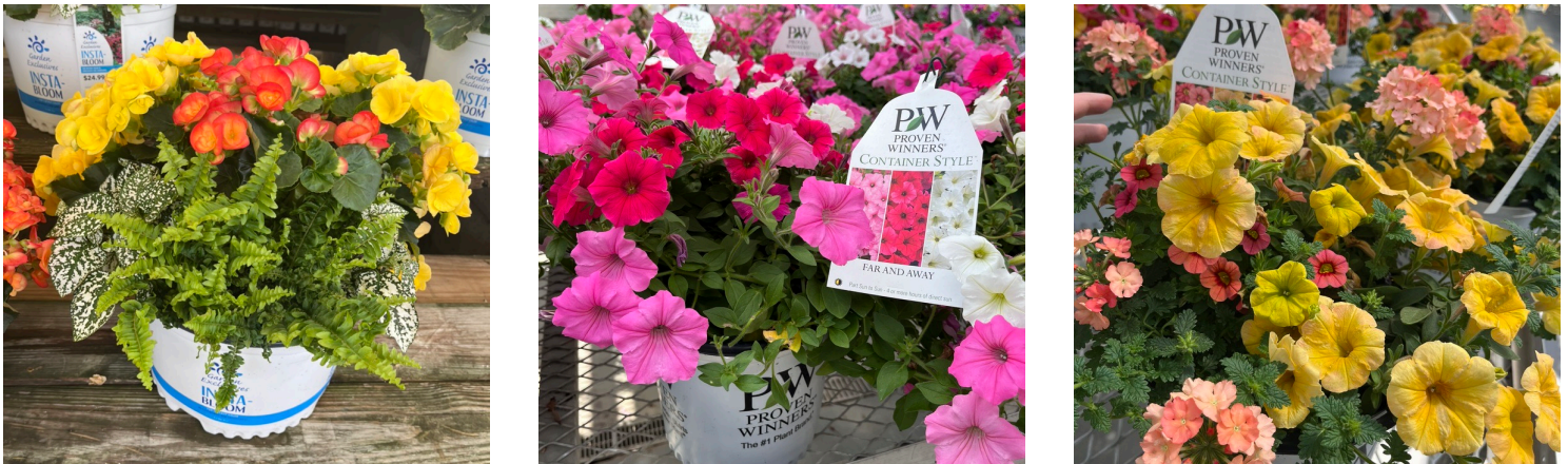
Photo 2. Three large gallon-sized mixed containers to be dropped into larger containers to provide instant color without the hassle of needing to do-your-own mix and match different plant species.

People can express their individual tastes by selecting from a variety of combinations without needing to design the containers themselves. Pre-assembled options are convenient options to have instant color in the garden, on the deck, or the patio.