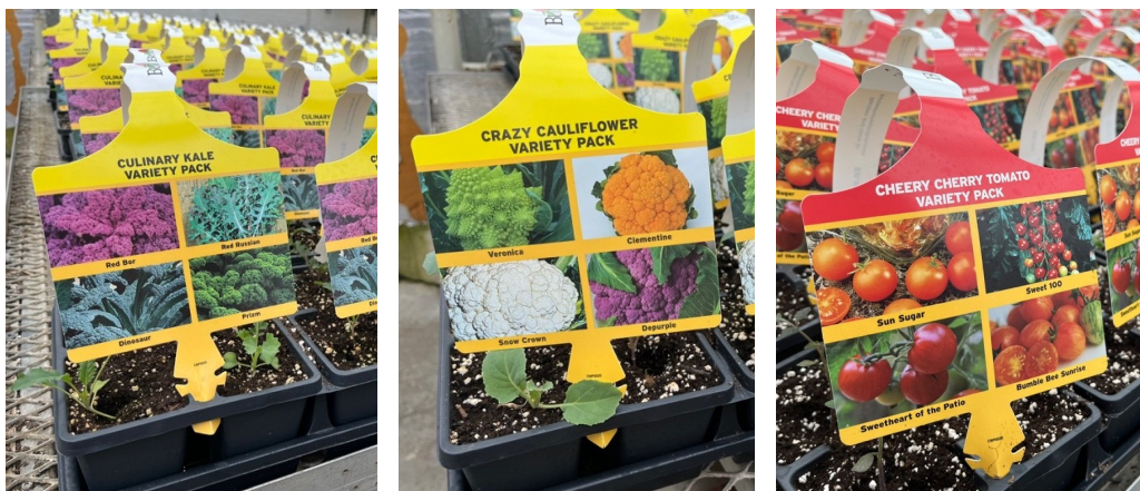
Photo 6. Variety packs of culinary kale, crazy cauliflower, and cheery cherry tomatoes.

Beyond ornamental containers, edible gardens are appealing to many consumers, especially those who are price-conscious, health-oriented, or looking for a sense of accomplishment. There are many opportunities to use edible gardens to attract customers. For instance, vegetable transplant combinations provide lots of value to customers. Anyone that has grown tomatoes or zucchini, knows that you don't need too many plants to have enough produce to feed a family. The high productivity is partially why these combo packs of tomatoes, crazy cauliflower, and culinary kale are so interesting for consumers (Photo 6).