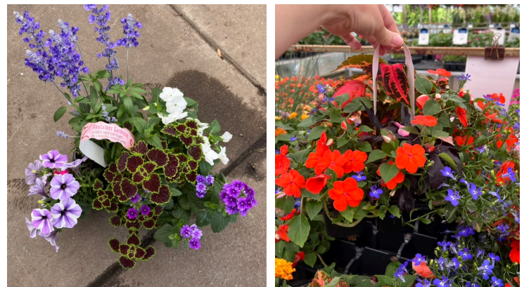
Photo 3. Mixed 6-packs of compatible plants with a carrying handle for ease of handling and fast planting into containers.

Both container gardening packs are great for those who fancy themselves more as ‘home decorators’ than gardeners or may have uncertainty about which plants go together in terms of design or care requirements.