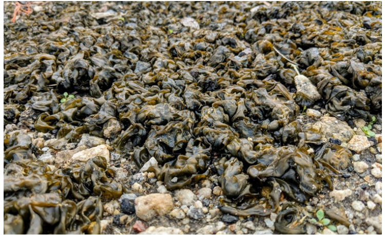
Figure 2: Gelatinous mass of Nostoc after absorbing moisture.