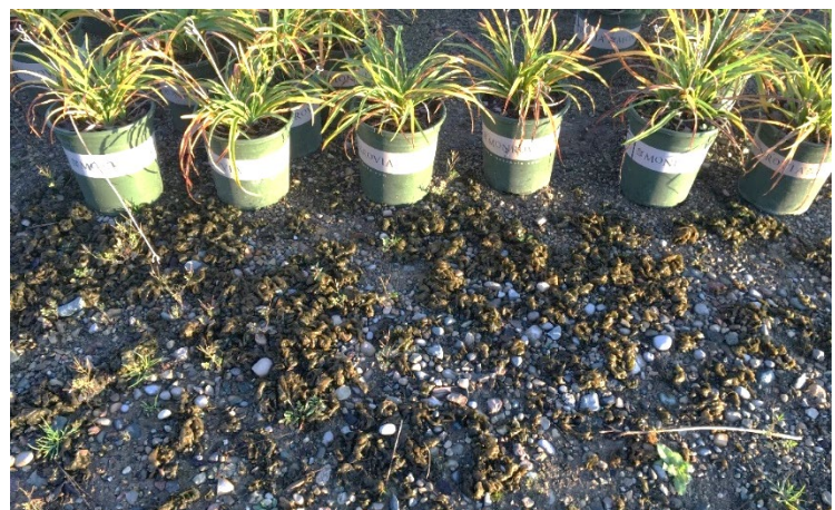
Figure 4: Gelatinous mass of Nostoc growing on hard surface of nursery where irrigation is frequent.