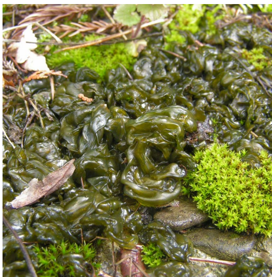
Figure 1. Visible slimy mat of Nostoc on greenhouse walkway hard surface.

Colonies of Nostoc are made of long filamentous chains, or strands of cells that continue to elongate without separating and can go on to form both microscopic groups under the soil as well as visible mats on a surface (Fig 1).