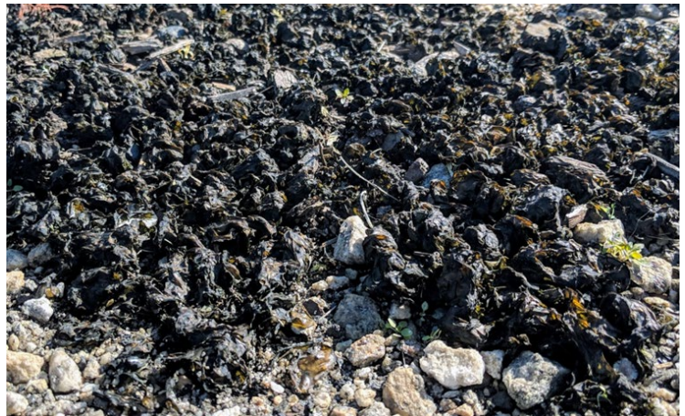
Figure 3: Desiccated Nostoc surviving on dry hard surface.