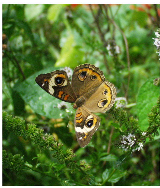
Common buckeye butterfly.

Last spring my Assistant Entomologist and I were asked to speak about butterflies to a garden group. Before getting on with the business of attracting them, we decided to discuss how to generate more of them (and our moth friends) through plant selection. Since a very tender age I've known the fascination of watching pet caterpillars transmogrify to something entirely other - as Buckminster Fuller said, 'There is nothing in a caterpillar that tells you it's going to be a butterfly.' Now I actually can rear them as part of my job, as staff discovered after finding the occasional one gone rogue in the lab. But it's easier to let nature do it for you: consider choices for your customer's flower garden that provide food for both the adults (butterflies, moths) and their caterpillars, many of which are beautiful and interesting in their own right. While most moths are active during evening hours - the garden is a different world worth inspecting after dark- some, like the beautiful white-lined sphinx ( Hyles lineata ) or the amazing hummingbird moth ( Hemaris diffinis ), will be active during daytime. For purposes of most readers the discussion will be restricted to herbaceous ornamental flowering plants, but woody plants, grasses, weeds, and others are hosts to many butterflies, moths and their caterpillar stages we (and hungry birds!) also like having around.