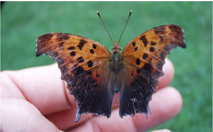
Question mark butterfly.