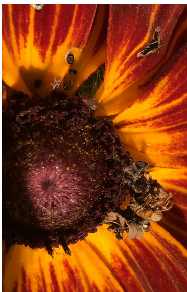
Find the caterpillar! A 'camouflaged looper' is at the lower right of center