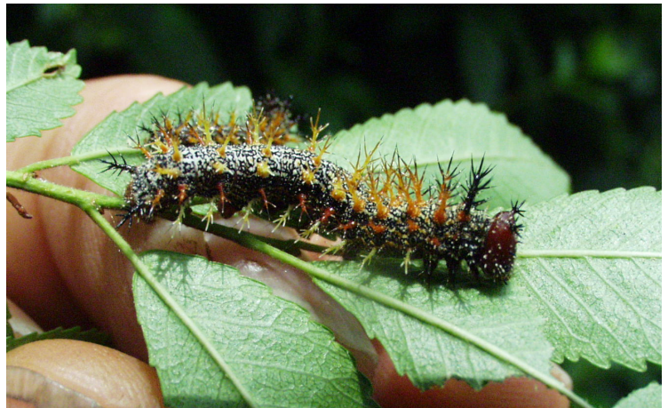
Question mark caterpillar.