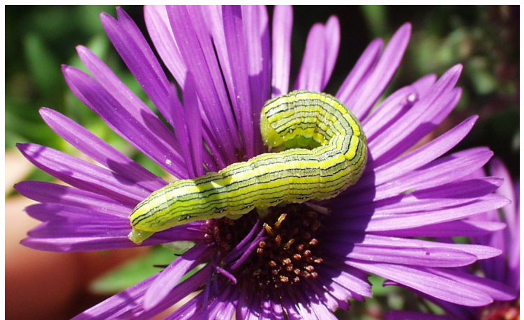
The asteroid, Cucullia asteroides , on aster.