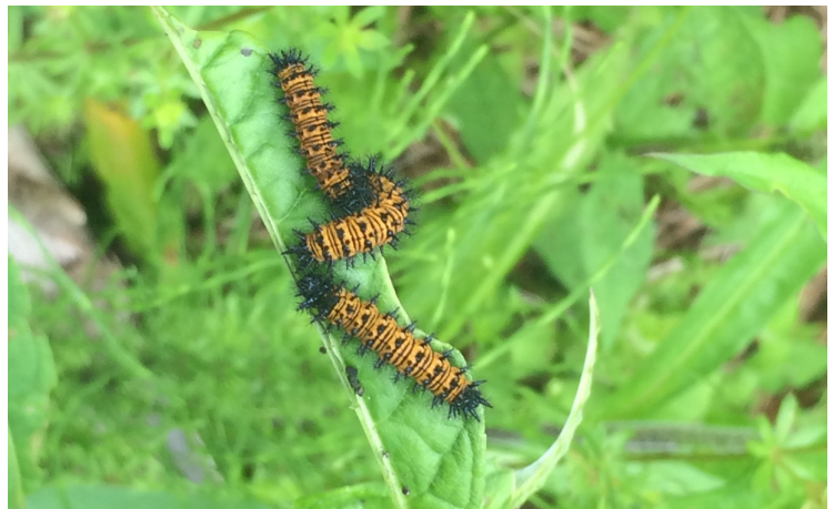
Baltimore checkerspot on turtlehead