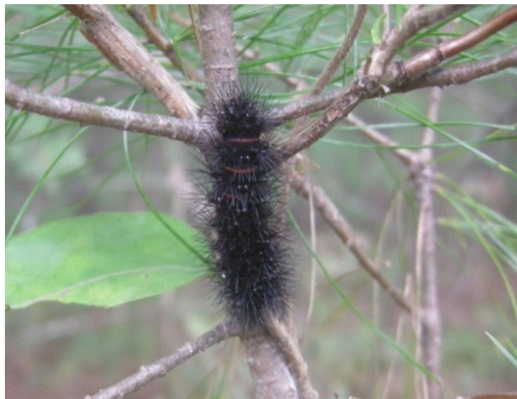
Giant leopard moth caterpillar.

Asters are hosts to many other caterpillars, many of which are also attractive in their moth stages. These include the black arches ( Melanchnra assimilis ), the asteroid ( Cucullia asteroides ), brown-hooded owlet ( C. convexipennis ), pearl crescent ( Phyciodes tharos ), Harris' checkerspot ( Chlosyne harrisii ), and the striped garden caterpillar ( Trichordestra legitima ). All are beautifully colored, most with bright striping or ground colors. Look for another attractive owlet caterpillar, the Canadian owlet ( Calyptra canadensis ), on meadow rue.