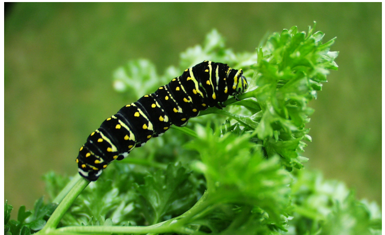
Black swallowtail caterpillars are often seen on parsley but will also feed on related plants like Queen Anne's lace.