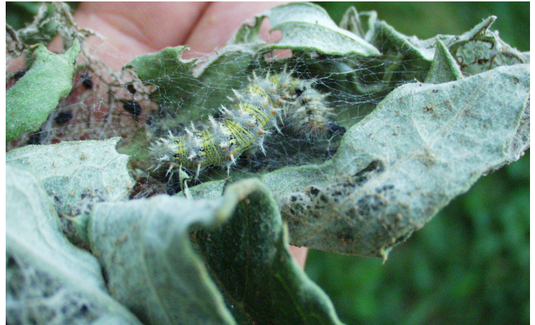
Painted lady caterpillar.