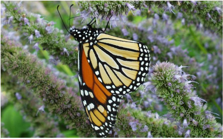
Invite monarchs to stay by feeding the caterpillars.