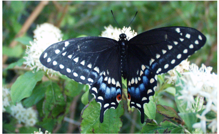
Black swallowtail butterfly.

Read more these insects and their caterpillar food plants by searching on-line at websites like BugGuide ( https://bugguide.net ) or helpful references like David L. Wagner's Caterpillars of Eastern North America (2005, Princeton Univ. Press) which includes color photos of the caterpillars (and the adults) or Jeffrey Glassberg's Butterflies Through Binoculars series.