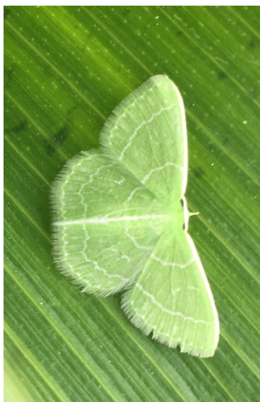
Wavy-lined emerald moth, the adult of the camouflaged looper.