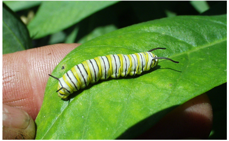
Monarch caterpillar on swamp milkweed.