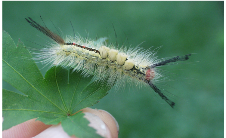
Whitemarked tussock moth caterpillar.

Camouflaged loopers, Synchlora frondaria , are startling sights feeding on flowers, covering themselves with petals and other bits chewed off the host. I've seen the caterpillars on Rudbeckia flowers, but look for them on ageratum, asters, goldenrods, yarrow, ironweed, and other hosts. The adult, the wavy-lined looper, is a small bright green moth I've encountered during the day resting on leaves.