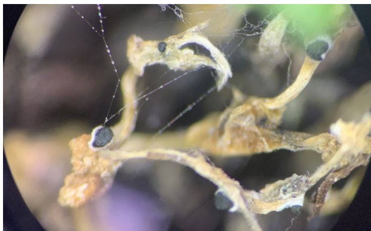
Figure 6: Myrothecium sporodochia consisting of a mass of dark spores on a tuft of white fungal growth can be seen on infected tissues.