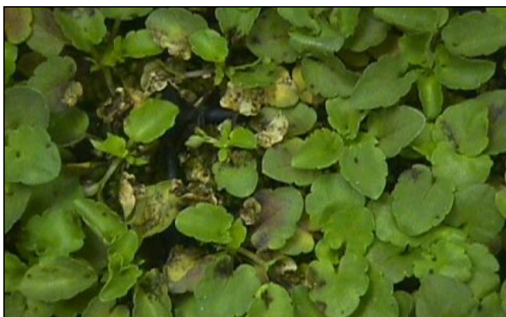
Figure 3: Cercospora leaf spot on pansy can spread quickly and kill infected leaves and small plants.