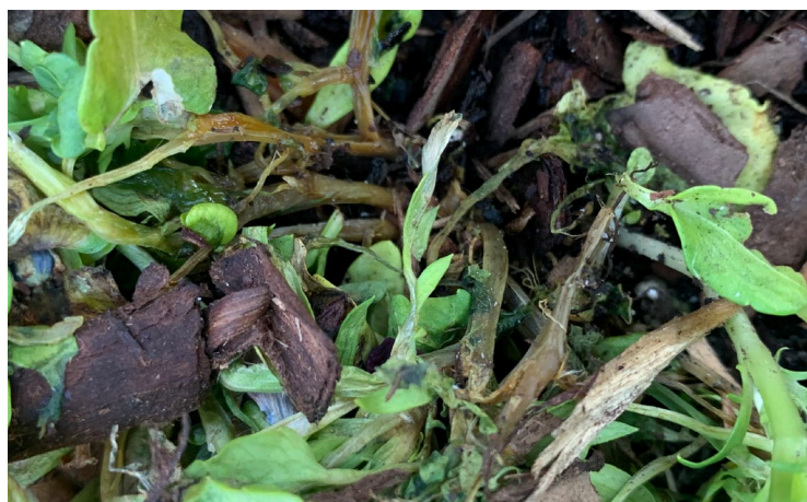
Figure 5: Myrothecium crown rot causes a brown, soft rot of pansy stems. Plant will collapse and die from infection.