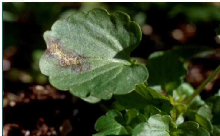
Figure 1: Cercospora leaf spot on pansy showing purplish, fringed margin with a tan center. Spores are produced on both the upper and lower leaf surfaces.

With the overcast, humid conditions in the southeastern USA, powdery mildew disease has been a problem in pansy production within greenhouses. However, if the current wet weather trends continue, it is unlikely that the disease will be of concern in landscape installations because wet foliage is not conducive to powdery mildew disease development. Powdery mildew infection causes patches of white fungal growth usually seen on the upper leaf surface. If infection is severe, leaves may become distorted and purplish (Figure 4). Powdery mildew develops under high humidity conditions. Plants that are nutritionally stressed are more susceptible to powdery mildew infection than non-stressed plants.