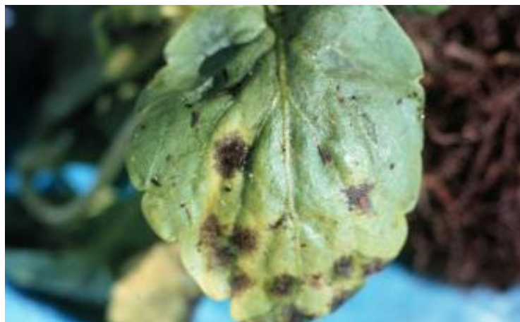
Figure 2: Multiple small, purplish leaf spots with a fringed bordered due to Cercospora leaf spot on pansy.