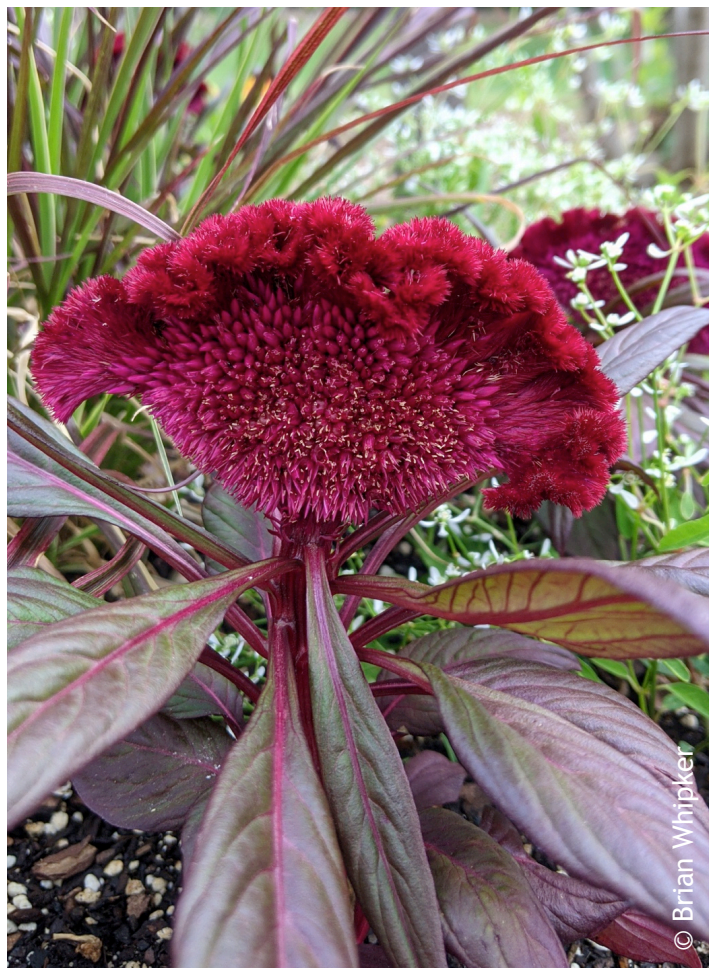
Figure 6. Crested celosia is a commercial example of fasciation grown by greenhouses and cut flower growers.