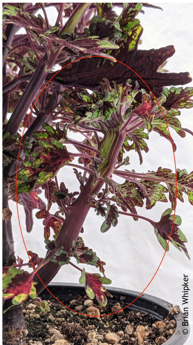
Figure 1. A close-up of a fasciated, flattened stem on a coleus plant.

Wild and 'abnormal' stem growth is sometimes observed on a wide assortment of plant species and often 'prized' as ornamental character. This spring, we observed firsthand wild stem growth during a coleus trial evaluating over 100 cultivars at both the University of Kentucky and NC State University. We were surprised to find 'abnormal' growth on