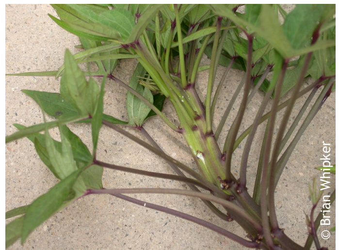
Figure 4. A sweet potato plant that developed a fasciated stem.