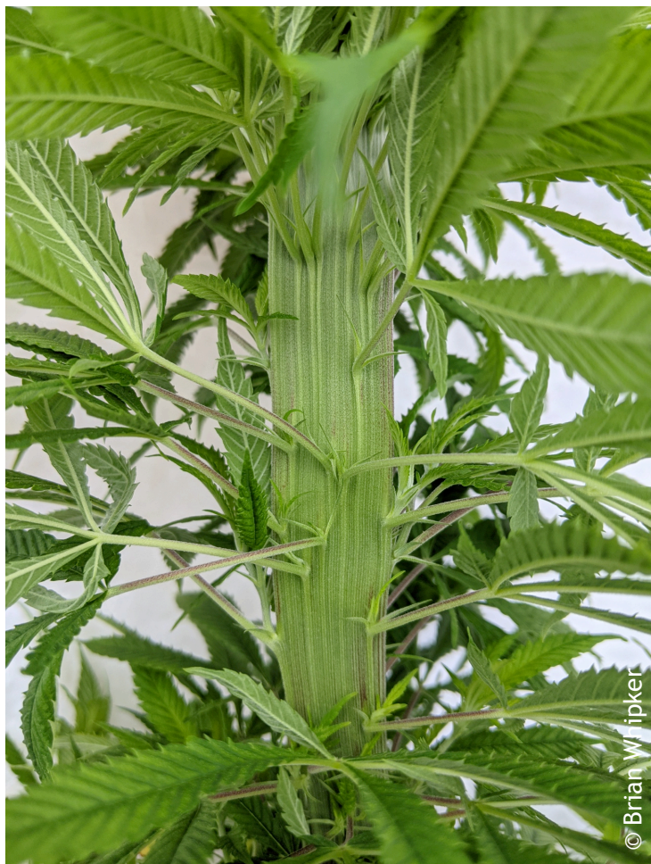
Figure 5. A broad, flat stem the developed out of terminal growth of cannabis.