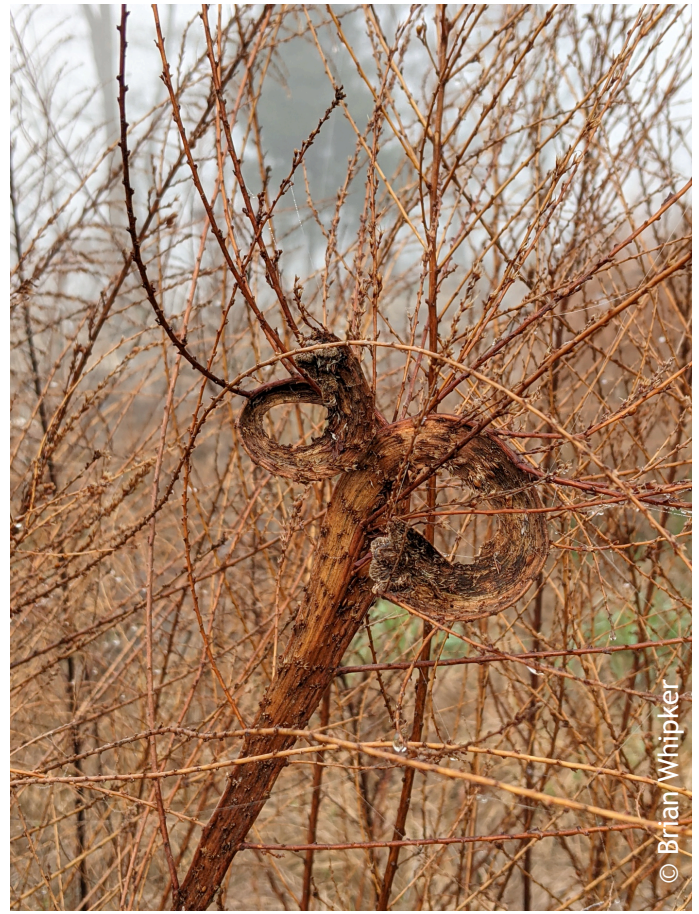
Figure 3. In nature, fasciation can occur on weeds.

For greenhouse growers, fasciation can be a prized attribute. It occurs infrequently as we observed it on only 2 plants out of 3000 coleus we grew (0.067%), so it is an amazing discovery. As ornamental plant growers we are naturally curious about the abnormal growth, so it is to be expected that we are fascinated with fasciation.