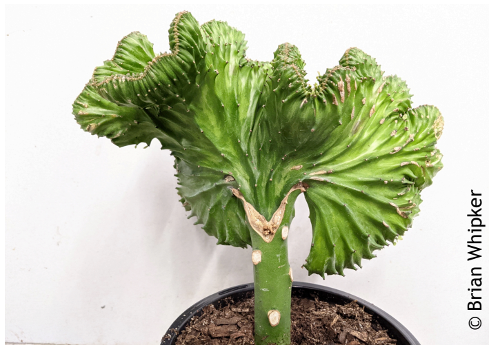
Figure 7. The distortion of fasciation is a commercially desirable trait among the ornamental industry as seen here with a grafted cactus.

White, O.E. 1945. The biology of fasciation and its relation to abnormal growth. J. of Heredity , 36(1): 11-22.