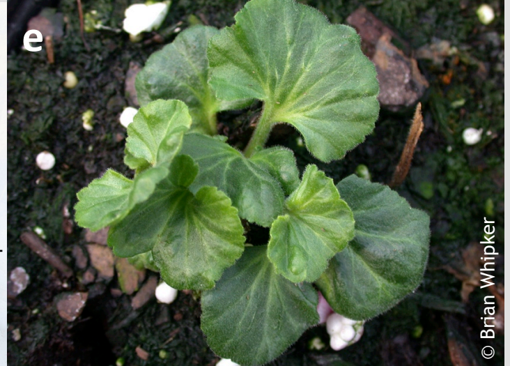
Figure 8. Distorted Growth Mimics of Fasciation.