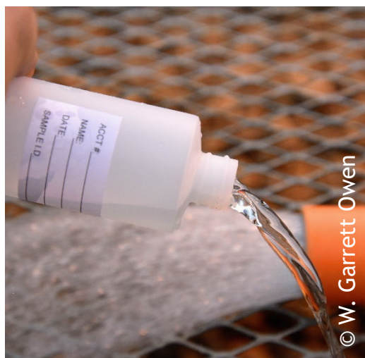
Figure 4. Rinse plastic container 2 to 3 times with the irrigation water to be sampled.