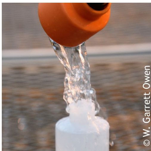
Figure 5. Fill the plastic container with the irrigation water and cap tightly.