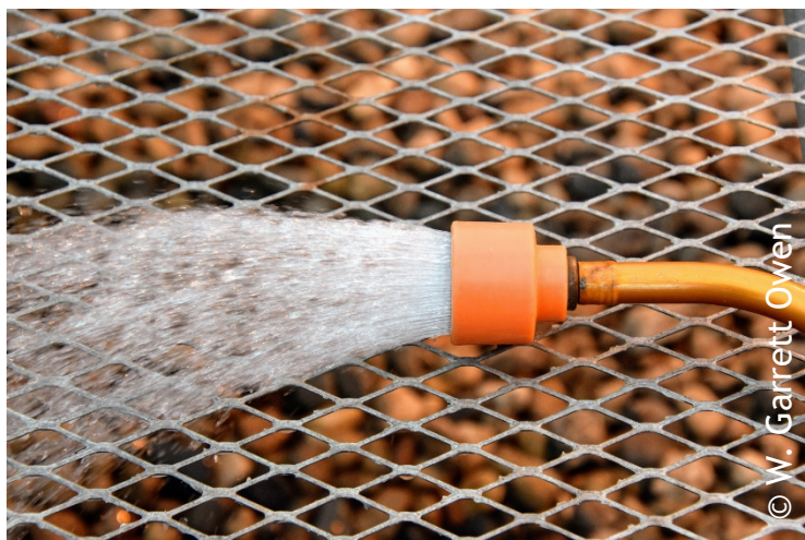
Figure 2. Turn on irrigation and allow water to run for five minutes to clear the line of impurities.

The American Floral Endowment is gratefully acknowledged for funding to create fertdirtandsquirt.com and establish all available materials.