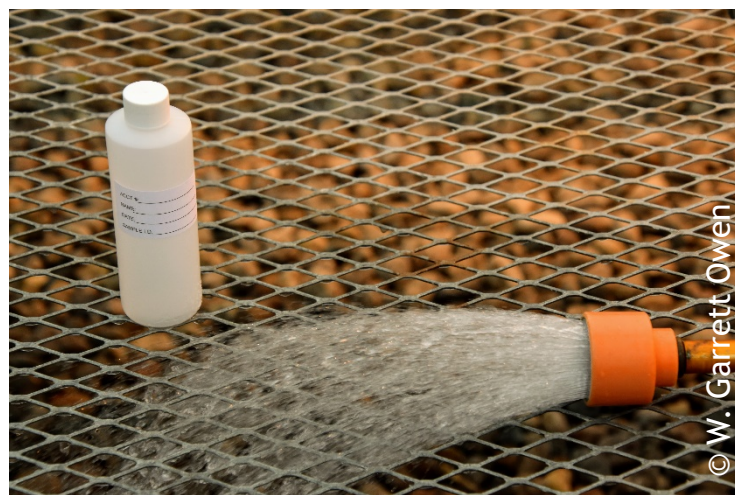
Figure 3. Label lab issued clean, plastic container with your name and/or operation name, address, water source, and analysis requested.