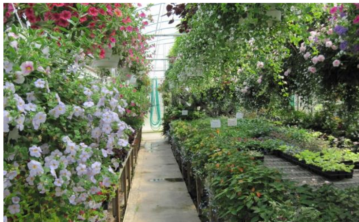
Figure 1: Overpopulated greenhouses and reduced airflow increases the risk of botrytis infection.

While you may ask yourself, what does media pH have to do with a botrytis problem? Well it doesn't in most cases except when the irrigation water has a high pH or high-water alkalinity level.