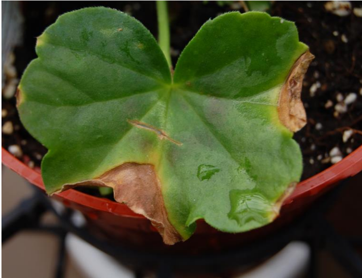
Figure 4: Botrytis on Ivy Geranium