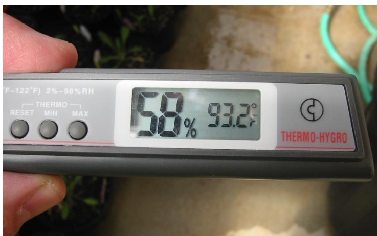
Figure 3: Portable hygrometers can be effective in troubleshooting a greenhouse.