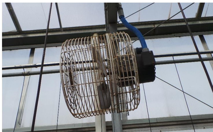
Figure 2: Horizontal airflow fans can reduce botrytis outbreaks if used correctly.