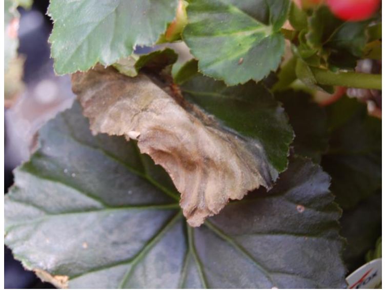
Figure 5: Botrytis on Nonstop Begonia