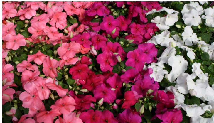
Figure 1. Even with the threat of downy mildew, common seed impatiens ( Impatiens walleriana ) continue to be one of the most popular bedding plants for shade gardens worldwide. Luckily, resistant varieties have been recently released.

Seed and vegetatively propagated Impatiens spp. including common seed impatiens ( Impatiens walleriana ), double impatiens, and garden balsam ( Impatiens balsamina ) are susceptible. Fortunately, New Guinea impatiens ( Impatiens hawkeri ) appear to be tolerant or resistant to downy mildew. The downy mildew disease that affects Impatiens spp. is caused by a fungal-like microscopic organism called Plasmopara obducens . This downy mildew is unique to impatiens. Snapdragons, roses, impatiens, coleus, basil, and other crops are susceptible to downy mildew but each have a