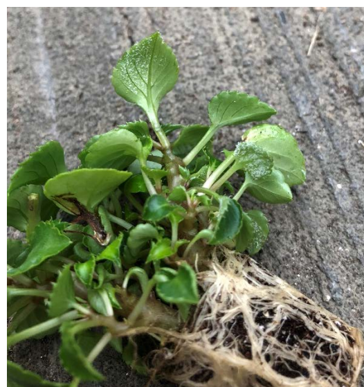
Figure 6. White fuzz on the underside of a double impatiens leaves.