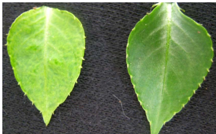
Figure 3. A yellow leaf can indicate downy mildew infection (left), compared to a healthy green leaf (right).