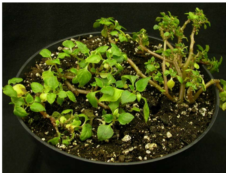
Figure 4. Impatiens stunted by downy mildew infection.

Systemic fungicides can be especially helpful in managing downy mildew because these products are absorbed by the plant in a limited way and can fight the downy mildew pathogen effectively. Subdue MAXX and Segovis are both systemic fungicides and are especially effective when applied as a drench. On page 4, there are two fungicide programs outlined. One is for the bedding impatiens and double impatiens that have not been bred to be resistant to downy