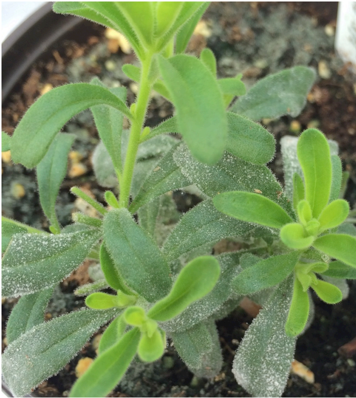
Powdery mildew on calibrachoa