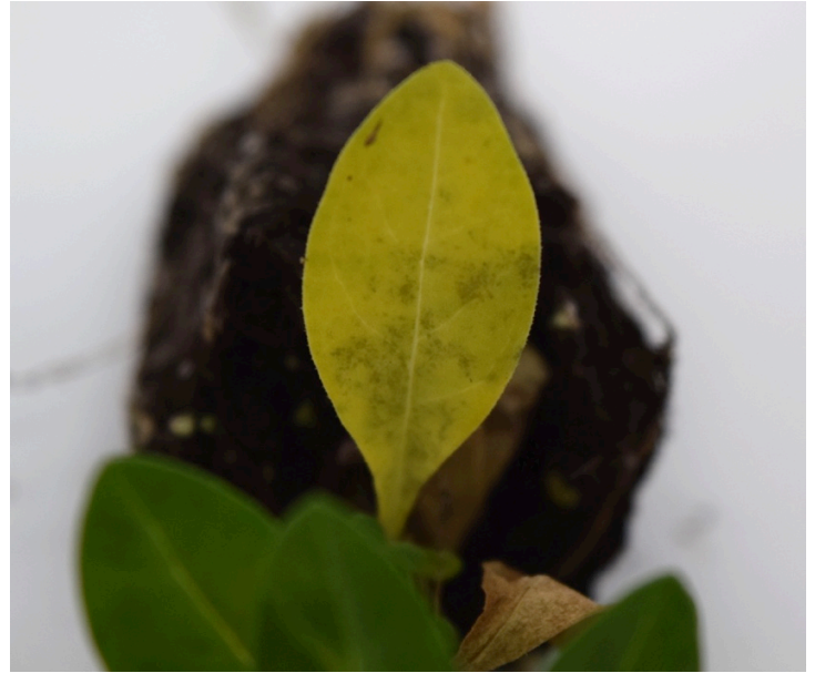
A closer view of early symptoms of powdery mildew on calibrachoa

colored fungal mycelial threads or spores. Using high light and magnification can help - I find that holding and rotating leaves in a bright ray of sun helps me to better see what is on the surface of the leaf. Identifying powdery mildew in its very early stages sometimes requires the help of a microscope, and assistance from a diagnostic lab might be necessary. Yellow mottling might also be an indication of a virus infection (e.g. Tobacco mosaic virus and/or Calibrachoa mottle virus), so keep this possibility in mind as well.