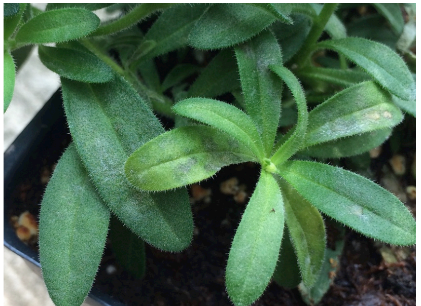
Above: Early symptoms and signs of powdery mildew on calibrachoa.