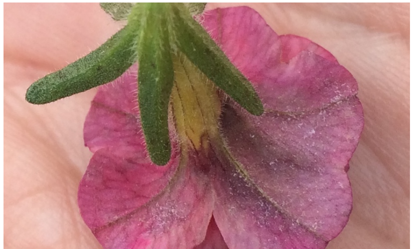
Below: Powdery mildew on flower petals