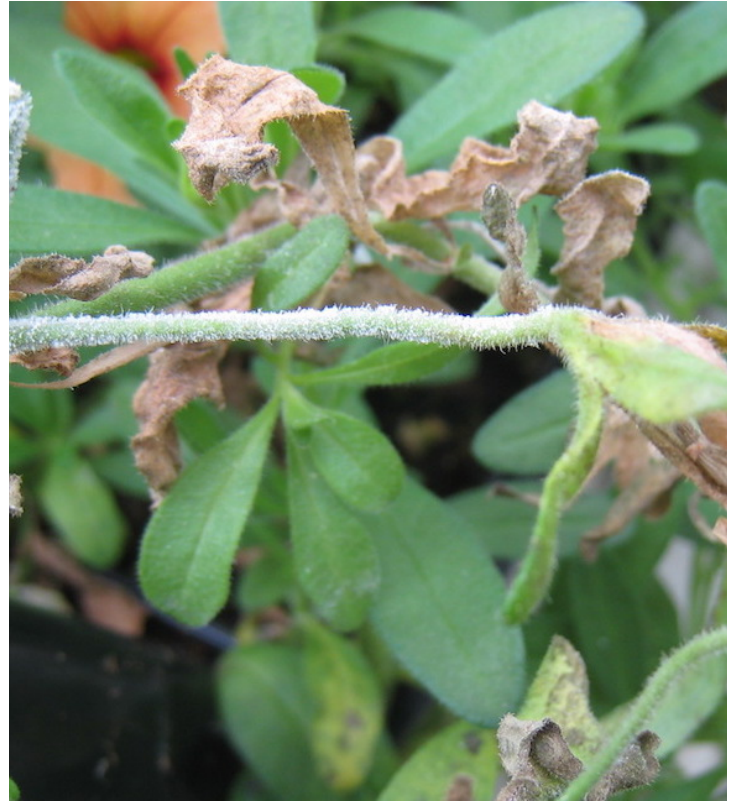
Powdery mildew on calibrachoa

of fungicides is needed. Best management will be realized when there is an effective systemic fungicide used regularly in the rotation, alternating among fungicides with different modes of action (or FRAC groups) which can include fungicides and/or biopesticides. Species of fungi causing powdery mildew are known to have developed resistance in numerous cases, including P. xanthii in cucurbit crops. Therefore, it is especially important to pay attention to resistance management - rotate between fungicides with different modes of action and make sure to follow label directions regarding appropriate rates and application timings.