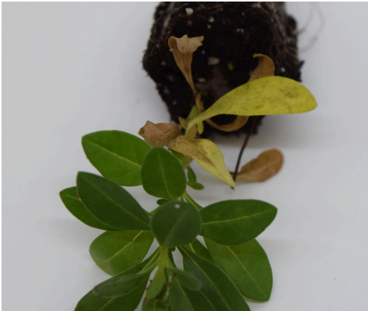
A closer view of early symptoms of powdery mildew on calibrachoa