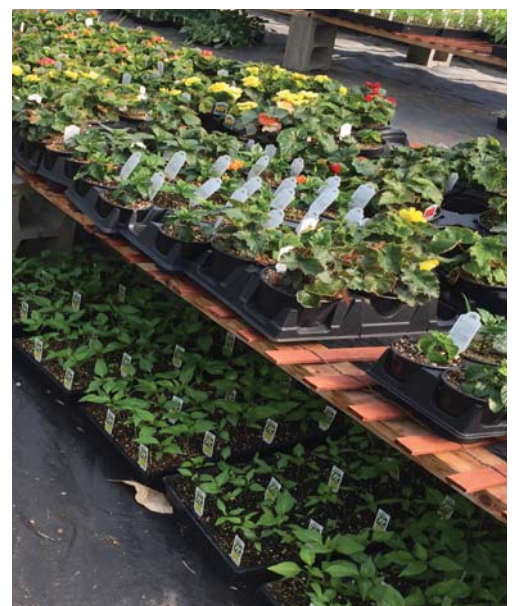
When retail greenhouse space gets scarce, plants literally get stacked up.