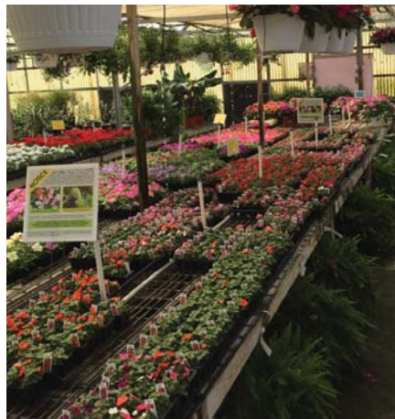
The greenhouse operation on the left creates extra display space by lining the pathway between two houses with benches. If cold weather is forecast, plants can easily be covered. The manager of the greenhouse on the right maintains clean sight lines and streamlined displays even when the greenhouse is very full, for a pleasant shopping experience.

they are looking for, to move freely along the aisles, or to differentiate between similar products.